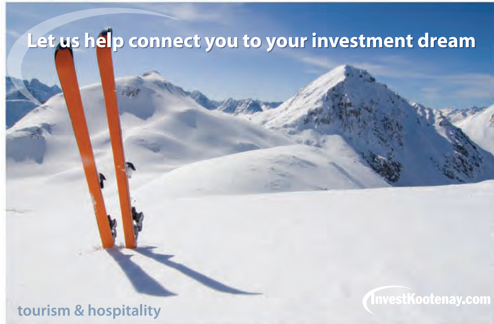
tourism & hospitality