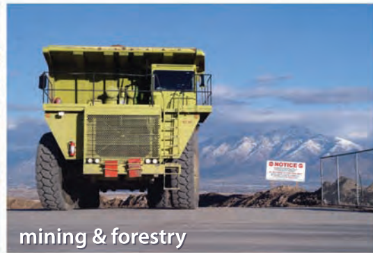
mining & forestry