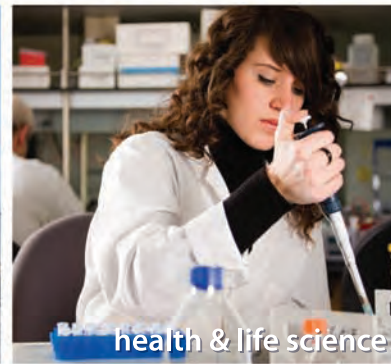
health & life science