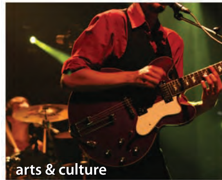
arts & culture